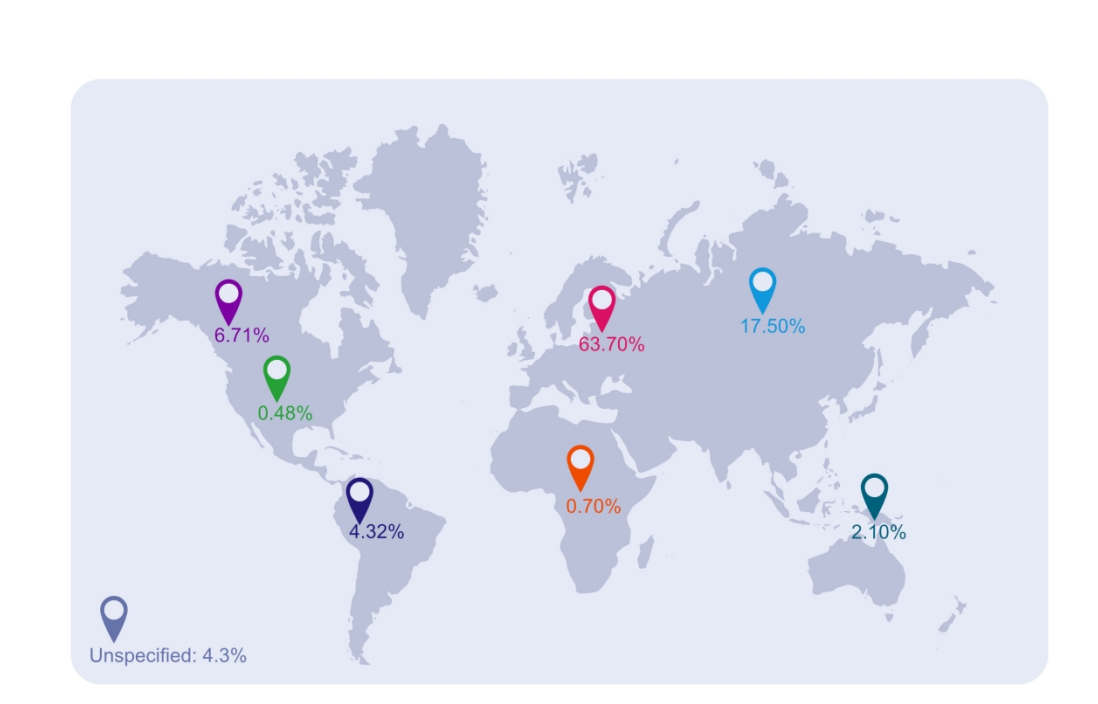
Figure 1_Pfaar et al.